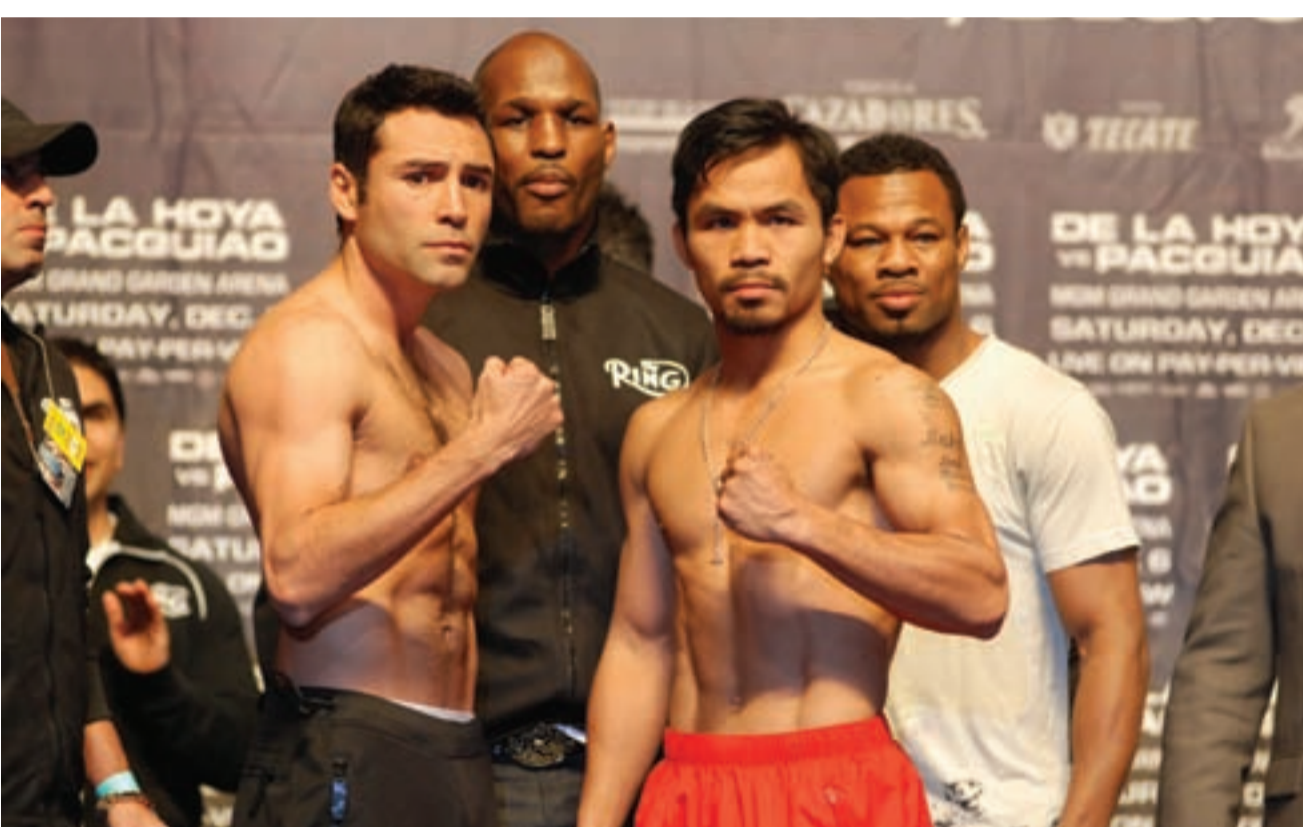
Oscar De La Hoya and Manny Pacquiao weigh in for their welterweight non-title bout at the MGM Grand.