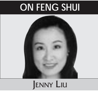
ON FENG SHUI