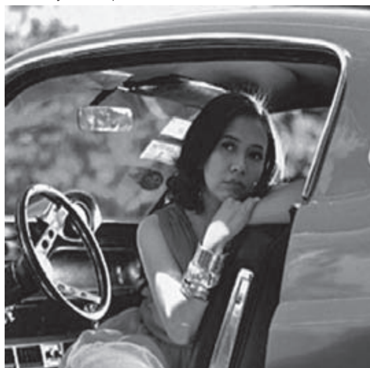
an artist. All the songs are her personal choices.