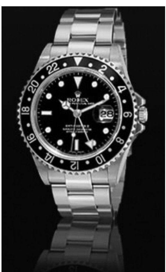
Picture yourself wearing a Rolex watch. Or how about giving a Rolex timepiece as a gift and as an unmistakably strong statement of your love and devotion? Check out The Watch Empire in Downtown Los Angeles. Over the years, it has become a respected leader in Fine Swiss Watch sales of new and pre-owned Rolex watches as well as other fine Swiss timepieces. They will beat any competitor's price. Call (213) 622-2622 for an appointment.

To save $100 on your purchase, simply mention the Asian Journal ad or mention Code A101 to get it. The showroom is located at 607 South Hill Street Suite 508 in Downtown Los Angeles. They will beat any competitor's price. Call (213) 622-2622.