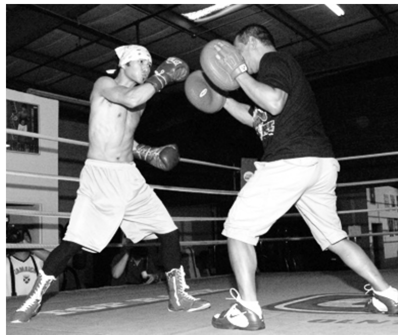
Pinoy boxer Nonito Donaire at Top Rank prepares to fight for WBA world super flyweight title against Rafael Concepcion, the headline match in "Pinoy Power 2" at the Hard Rock Casino in Las Vegas on Saturday, August 15.