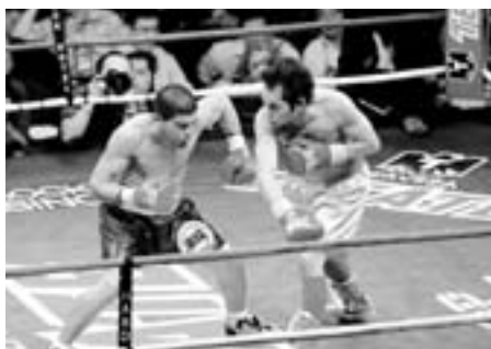
DOMINATION. Nonito Donaire Jr. (right) lands a right cross to the head of Rafael Concepcion during their 12 round bout at the Hard Rock Resort and Casino in Las Vegas, NV, on August 15. Donaire Jr. captured the WBA Interim Super Flyweight Title by unanimous decision.