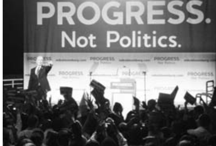
Incumbent Mayor Michael Bloomberg discusses his political views with his supporters.

The audience responded with cheers, and shouts of 'four more years'.