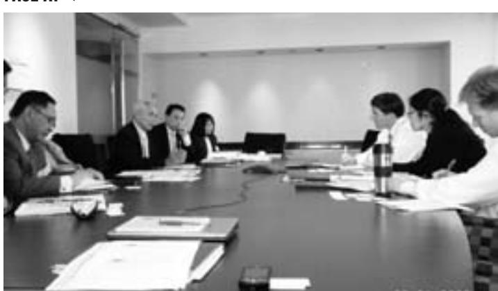
Finance Secretary, Margarito Teves and his team (left side) during a meeting with a US financial company in Boston, Massachusetts on 21 September 2009.

Central to the team's presentations were the Philippines' "economic growth" story and how it was able to weather the global financial crisis. The team also described the positive short- and medium-term outlooks for the Philippine economy. They assured current and prospective investors in the US of the vibrant economy in the Philippines and its continued attractiveness as an investment destination. The US companies commended the Philippine delegation for conducting the roadshow and providing them with timely and first hand information concerning the Philippine economy and investment climate as well as the policy thrusts of the administration of President Gloria Macapagal-Arroyo. ■