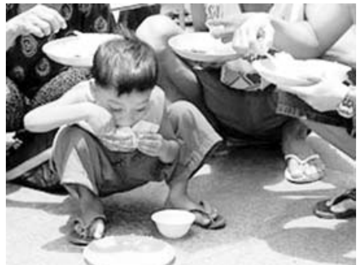
Militant groups dramatize their protest by eating noodles and dried fish at Plaza Miranda, Quiapo, Manila, condemning the Arroyo administration for spending thousands of dollars in a classy restaurant in New York.

"The law is very clear in that her obligation is to file her statement (SALN). It is now up for the concerned agency to look into any allegation of defect or irregularities in the preparation of this document or any issue that may be raised as to the contents thereof," he said.