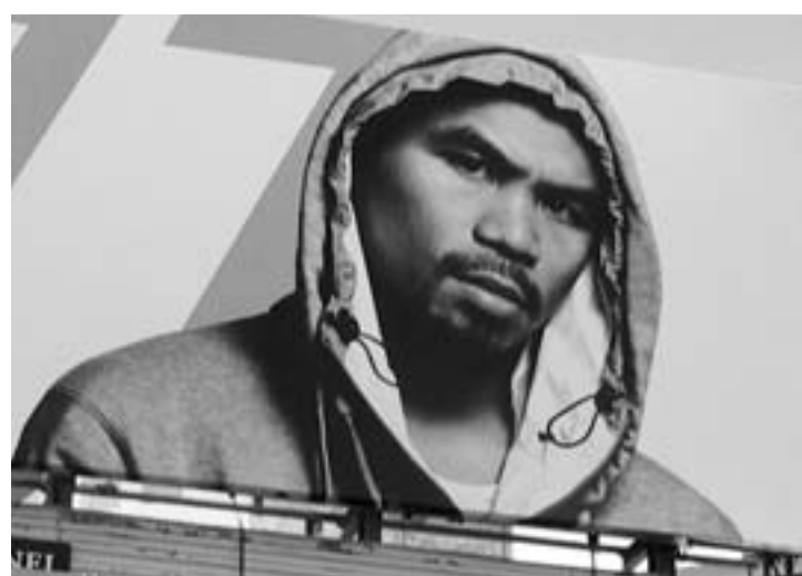
Manny Pacquiao's billboard in Hollywood on Selma Ave. and Vine St.