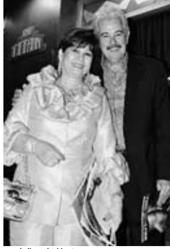
Annabelle and Eddie Gutierrez