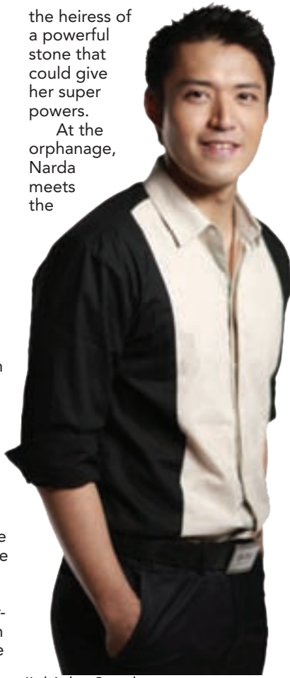
Mark Anthony Fernandez

man she loves – her childhood sweetheart Eduardo. But their romantic relationship ends when Valentina, Narda's friend, schemes to steal Eduardo from her.